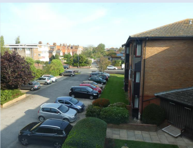
View from property